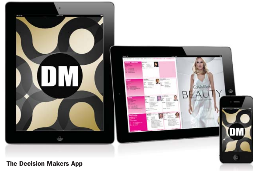
The Decision Makers App

All advertisements in our print editions will appear in the online/digital editions - giving you excellent added-value and visibility for your advertising.